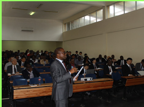
Part of the audience during symposium.