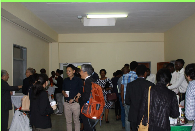
Networking during tea break.