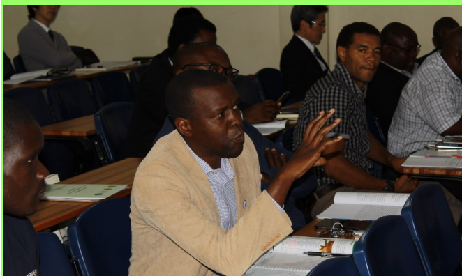
Participant asking questions during presentations.