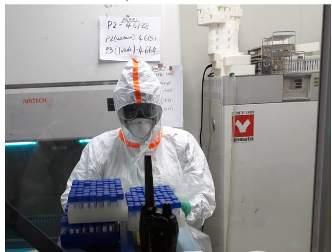
The University of Zambia is being used as one of the COVID-19 Centres in the country.