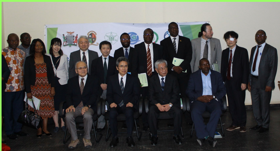
Staff from ACEIDHA and Hokkaido University Research Centre for Zoonosis