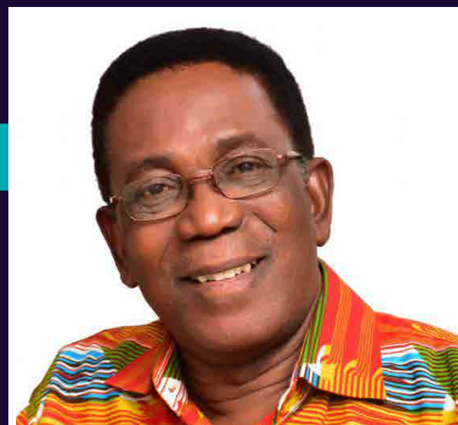
HOST HON. PROF. KWESI YANKAH Minister of State for Tertiary Education Republic of Ghana

REGISTER https://tinyurl.com/DIASPORA2020 EMAIL namo@aau.org secgen@aau.org kasam@aau.org