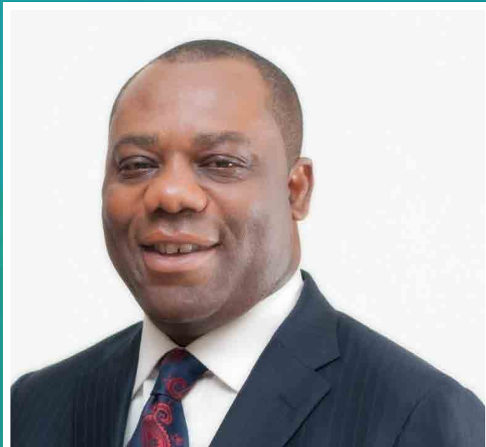
HOST HON. DR. MATTHEW OPOKU PREMPEH Minister of Education, Republic of Ghana