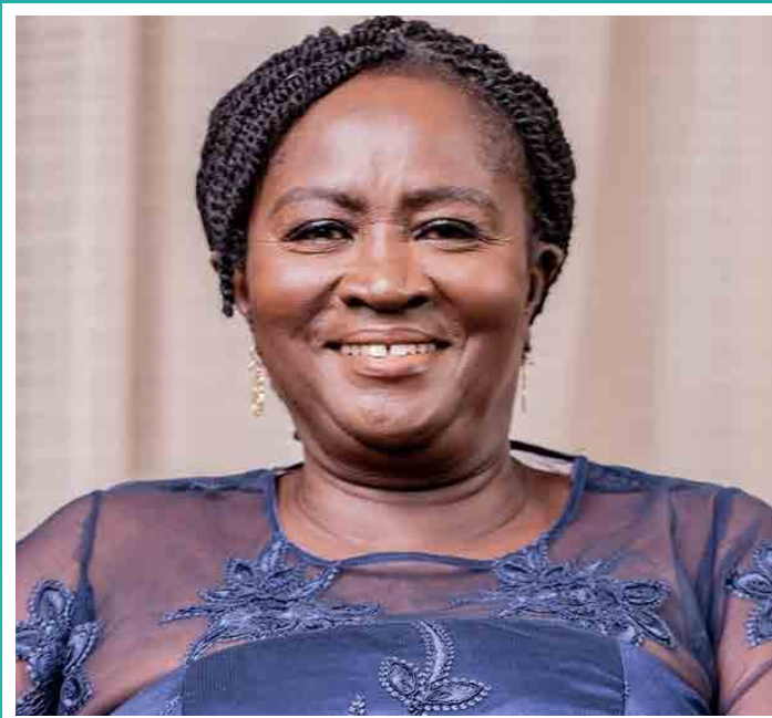
KEYNOTE SPEAKER PROF. JANE NAANA OPOKU-AGYEMANG Former Vice-Chancellor and Minister of Education, Ghana