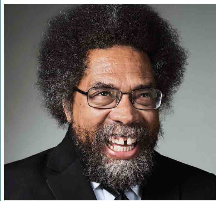
KEYNOTE SPEAKER PROF. CORNEL WEST Prof. Emeritus, Princeton University, USA