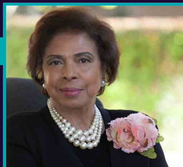
PANELIST DR. FAYE WILLIAMS National Congress of Black Women, USA