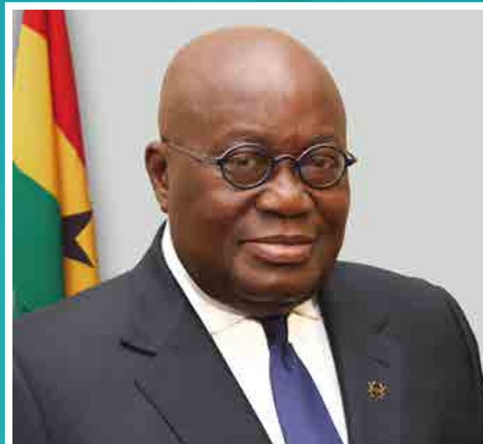
HOST HE. NANA ADDO DANKWA AKUFO ADDO President of the Republic of Ghana