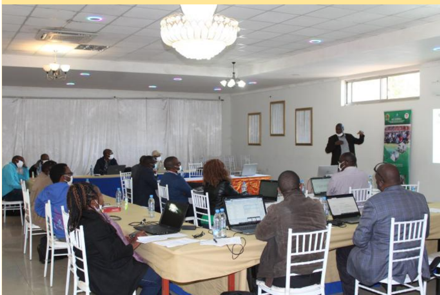
ACEIDHA and FORTECASE organised a digital studio workshop in Kabwe at Musiku Lodge whose main objective was to improve the quality of postgraduate training from 19 th to 25 th July 2020.