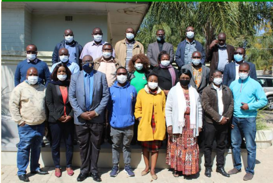
ACEIDHA and FORTECASE assembled a team to develop PhD Curriculum and record lectures for blended learning at Musiku Lodge in Kabwe.