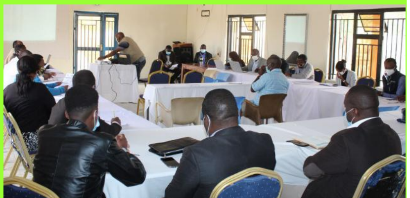
ZNPHI conducts training on how to handle COVID-19 transmission in Chirundu with support from ACEIDHA.