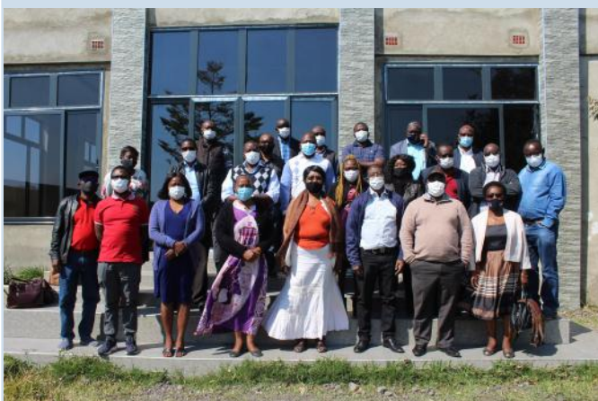
ABOVE & BELOW: Group photos taken on two different days of the workshop in Kabwe.